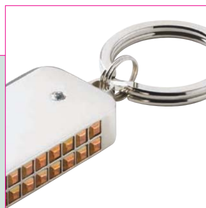
when Changed to keyholder